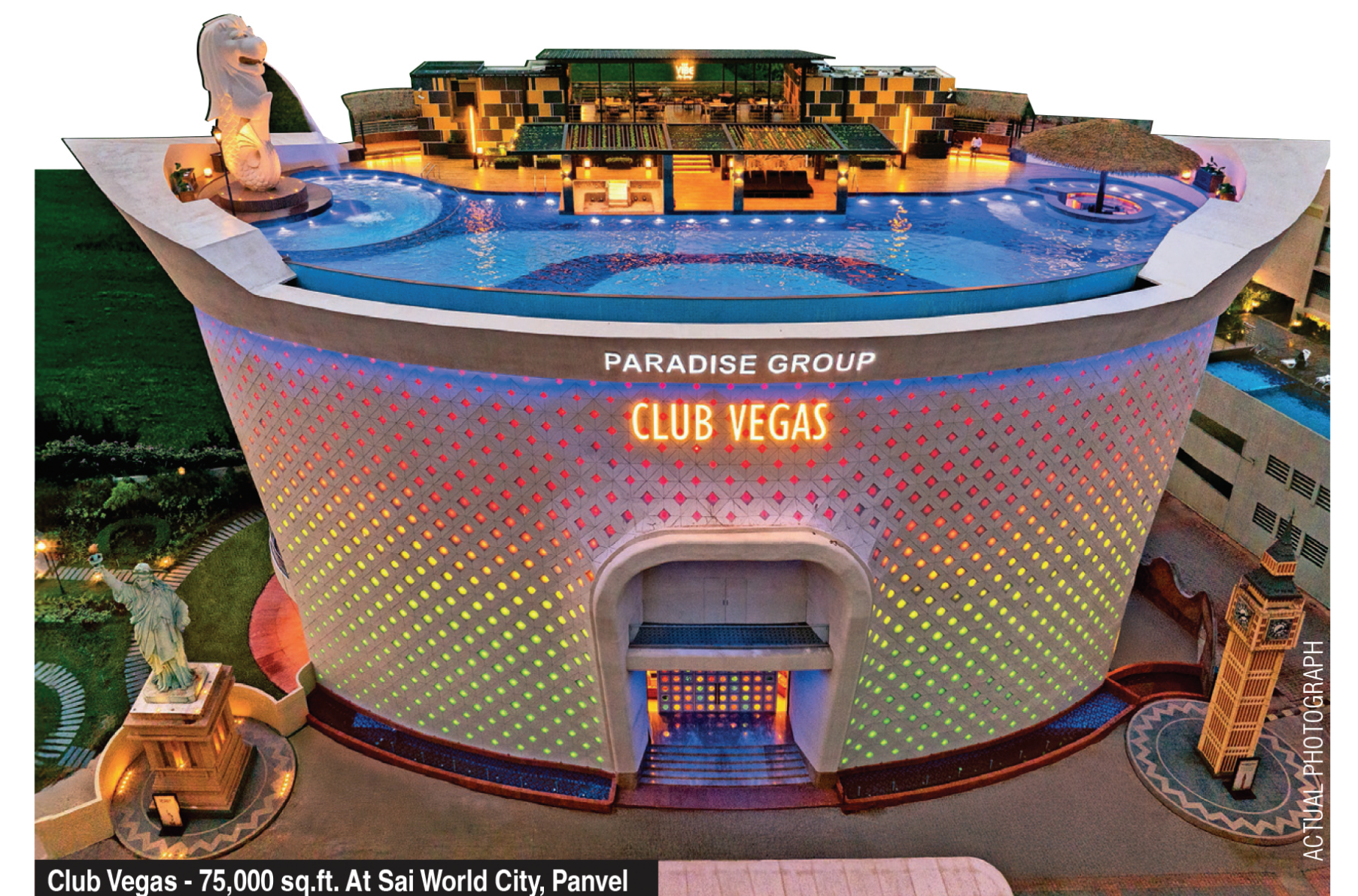
Club Vegas - 75,000 sq.ft. At Sai World City, Panvel

velopment approach around these fundamentals. The group follows transparent construction practices through stage-wise inspections, certified quality testing, real-time progress updates, predefined delivery schedules and complete operational transparency. Supporting this is an integrated ecosystem comprising advanced Mivan construction technology, an in-house RMC plant, material testing laboratories and dedicated legal, liaison and construction teams. These capabilities now form the backbone of Paradise Group's redevelopment journey.